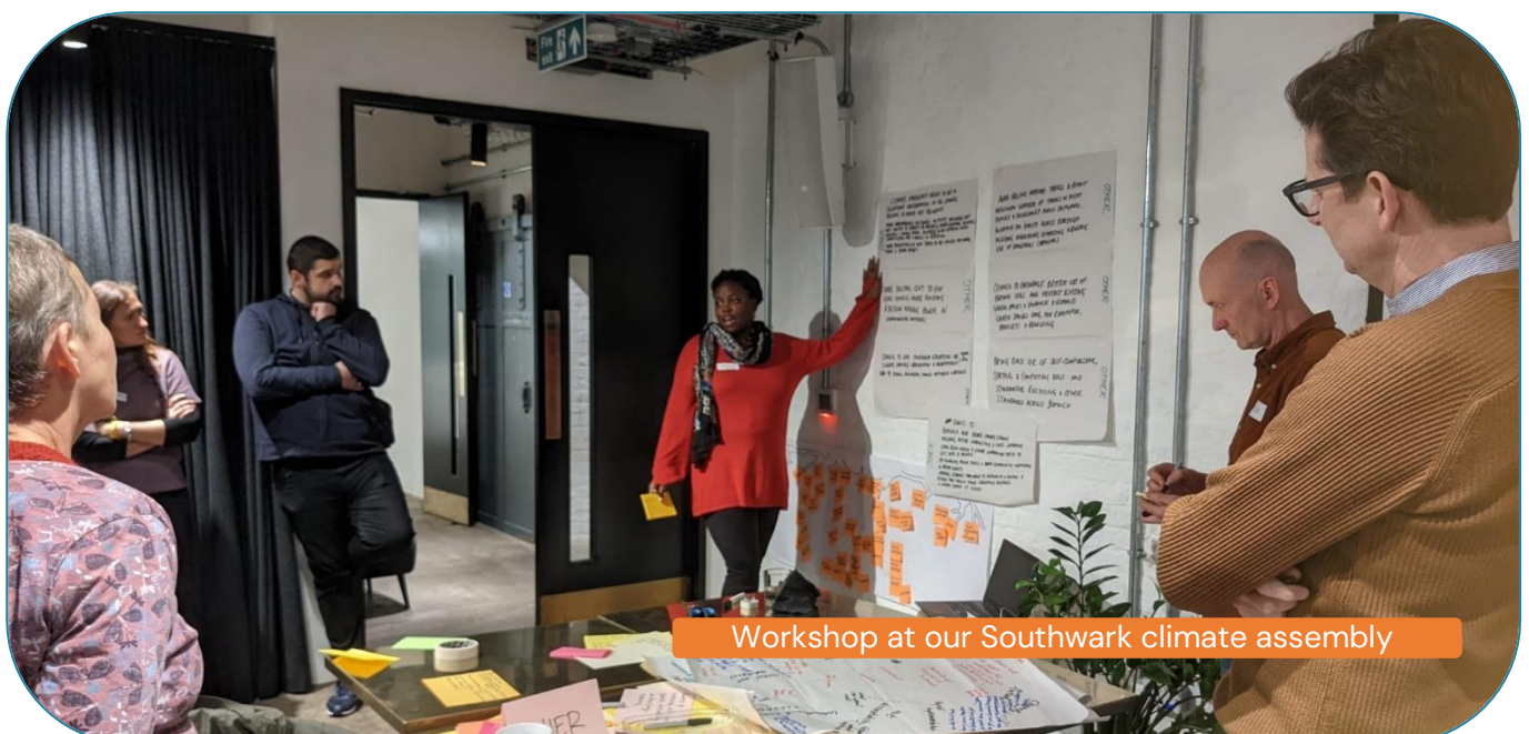
Workshop at our Southwark climate assembly

Shared Future facilitates citizen-led deliberations on a huge range of topics. As the facilitators we stand apart from making recommendations, and see our role as supporting the quality of the deliberation and making sure best practice is followed.