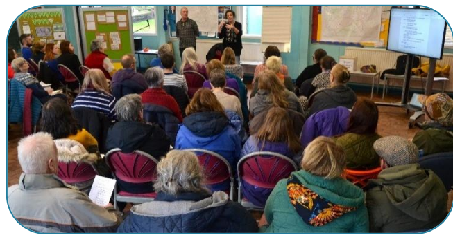
Shibley Town Council established a Green PB programme after running their climate assembly. 8

“Citizens' Assemblies allow citizens the means to influence wider plans around addressing the climate crisis”