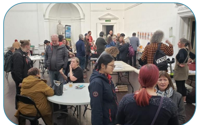
Your Pots, Your Say Regenerative Economy PB event in Lancaster 2024. 6