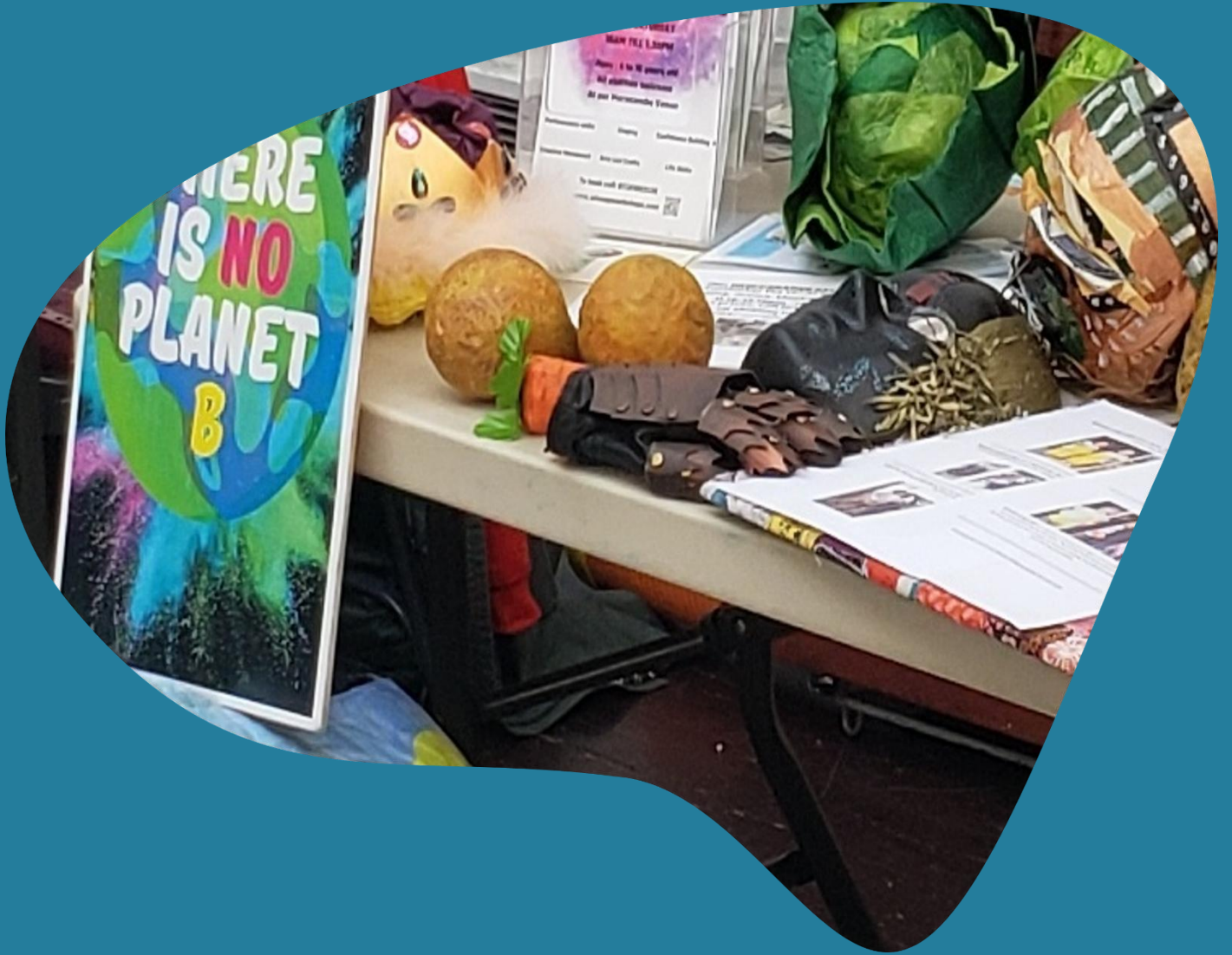
Your Pots Your Say, Lancaster 2024, applicant stall