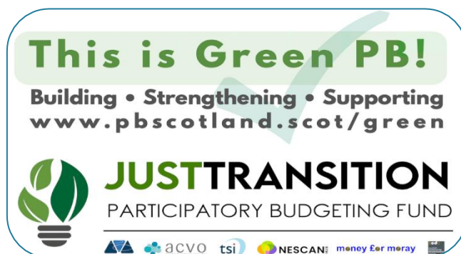
The Green PB Benefits badge from PB Scotland. 9