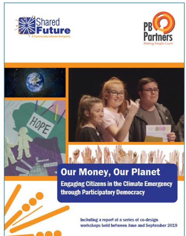
Cover of 2019 version of Our Money, Our Planet .