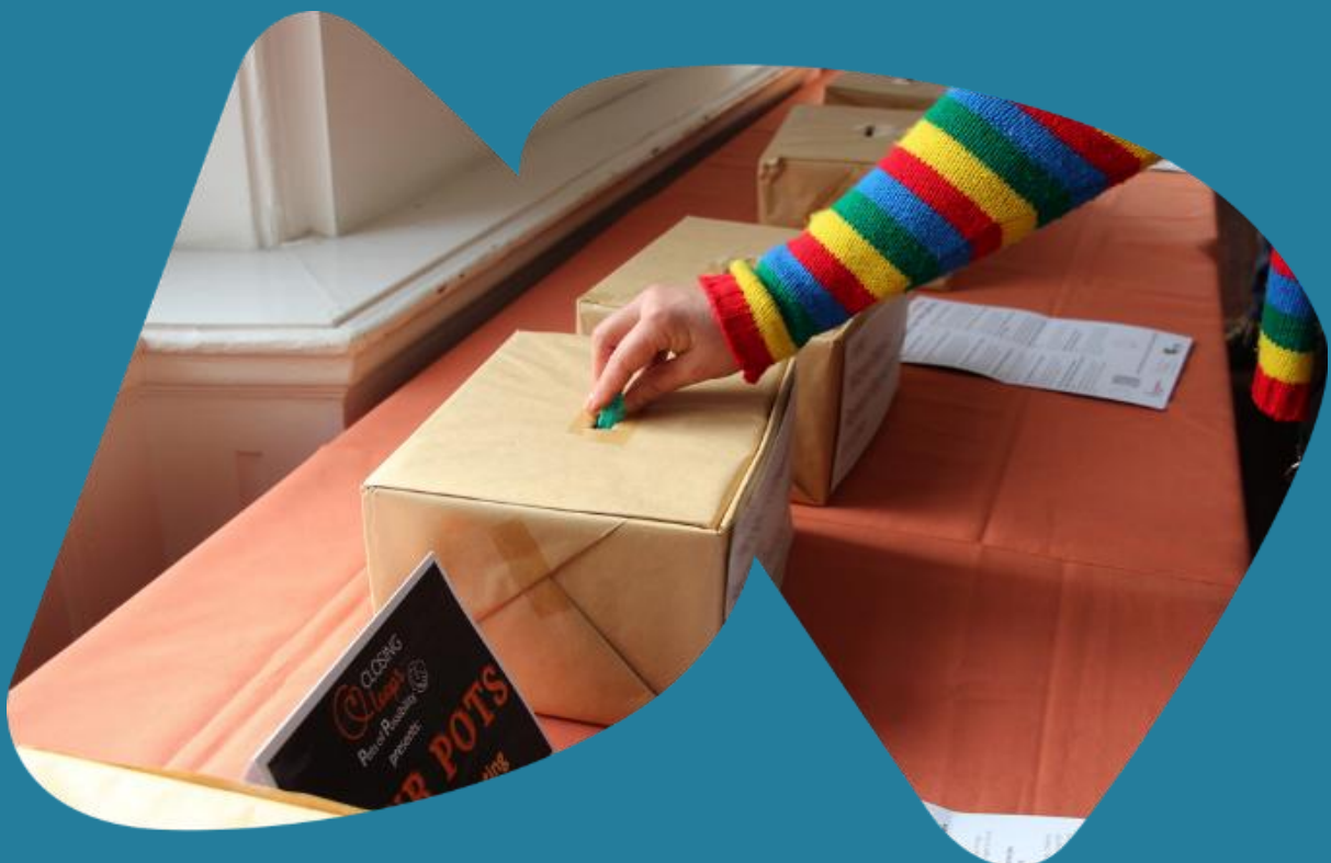
Cover Image: Your Pots Your Say, Lancaster 2023, participants This page: Community voting at Your Pots, Your Say 2024