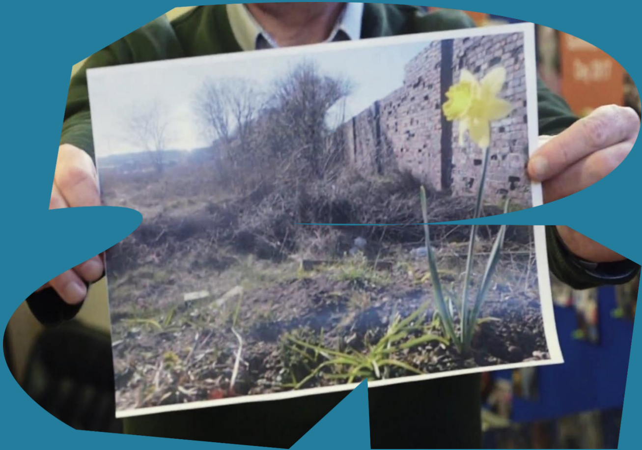
Screenshot from the video 'Moving Towards the Mainstream' by PB Scotland, 2018