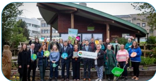
Dundee Council has now delivered three rounds of Green PB spending, totalling over £800,000. 7

“Once a Council had declared a climate emergency a (small grant) PB event would be a way to start.”